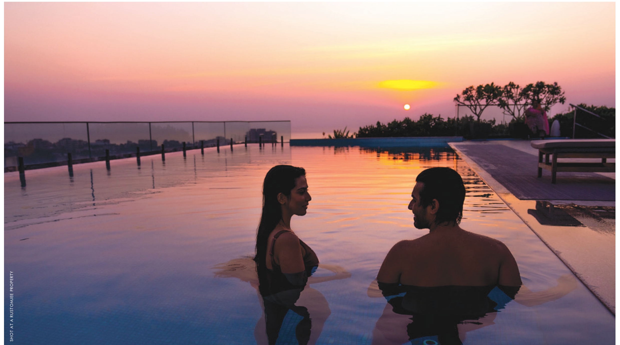
SHOT AT A RUSTOMJEE PROPERTY

As part of the Rustomjee gated community family, you enjoy exclusive access to events and activities curated for you to pursue your interests and hobbies.