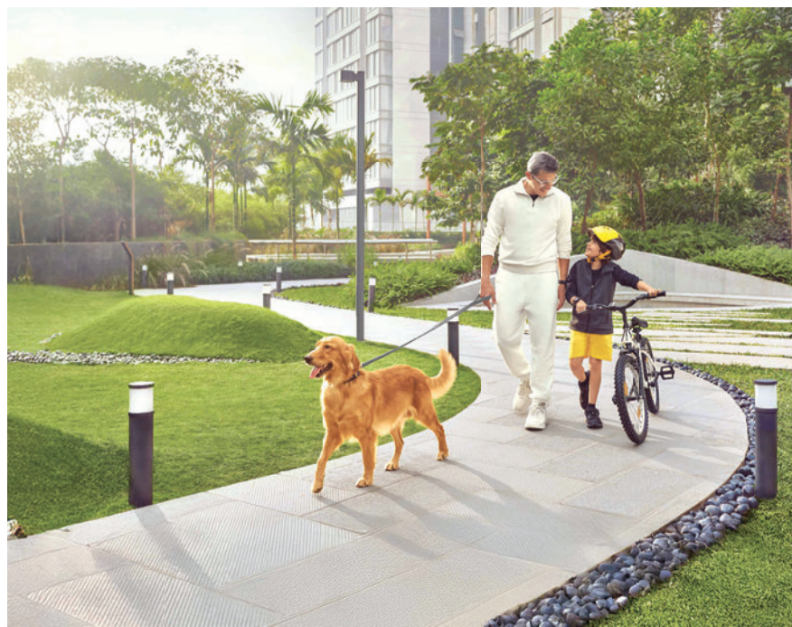
SHOT AT A RUSTOMJEE PROPERTY

DISCOVER THE PERKS OF LIVING IN A GATED COMMUNITY.